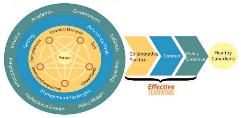
Diagram 2: A Conceptualization of Factors Required for Effective Teamwork to Improve the Health of Canadians

Diagram 2 presents a visual image of how the factors that affect effective teamwork in healthcare influence each other. Moving from inside out, the rings of the large circle represent the practice, organization, and system levels within the healthcare system. Within each ring, the different factors that must be considered are identified. Readers are cautioned not to overly interpret the diagram, as it is just a tool to promote better understanding of all the factors affecting effective teamwork.