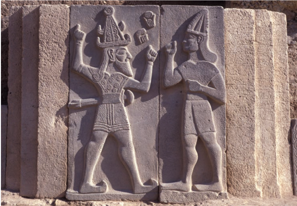
Fig. 2 Aleppo temple inscription of Taita I, photo courtesy K. Kohlmeyer