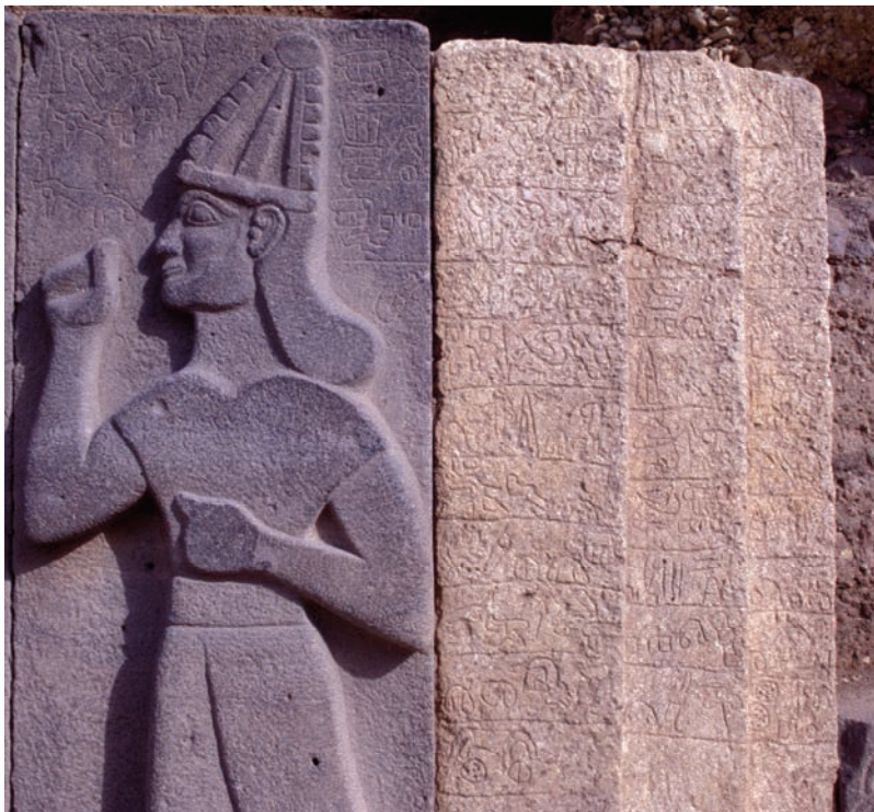
Fig. 3 Head of Taita I with Inscription, photo courtesy K. Kohlmeyer