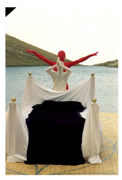
Fig. 7: Hamlet and Ophelia's dance of love-in-eternity. Film still from The Hamlet Adventure .

The action moves effortlessly between the material and the spiritual dimensions mapped in this manner. The Ghost, visualized as an enormous freestanding red object morphing with the human shapes within, malleable yet always aiming towards a perfectly spherical form, takes up a substantial part of the circular stage of the "Danish" world. In one scene Hamlet traverses its membrane twice, emerging from the Ghost's space in the here-and-now clad head to toe in a leotard of the same red fabric—a visualization of the spiritual dimension of Shakespeare's character. Ophelia, in spite of her entanglement in the perfidy of the court, is also portrayed as a creature from the beyond when she is alone with Hamlet. Together, they perform a ritualistic dance of love against the background of the mountain's hourglass of eternity. Their costumes in this scene, tight-fitting leotards worn over their heads that leave the actors faceless, are visually related to the otherworldliness of the Ghost and at the same time outline the tender attraction of the lovers' human bodies (fig. 7). In Ophelia's last dance, she sheds what looks like the straightjacket that has entangled her in the manipulations of the court for a smooth leotard reminiscent of her costume in the love dance scene. Once again, the camera frames her against the meeting point of the horizons of sky and water.