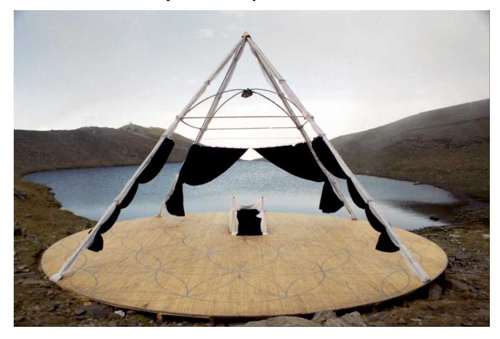
Fig. 6. Stage design.

The symbolic design of the stage is another geometric expression of the connectedness of the material and the spiritual. Circular, like "the pupil of the human eye" and the "cosmic channel" through which human life runs, in Semerdjiev's description, the stage is patterned with the overlapping circles of the Egyptian Flower of Life. The metal pyramid above it completes the divine geometry (fig. 6). Even when the stage is engulfed by fog, it is difficult to forget that the betrayals and murders at the court take place in the eye of the cosmos.