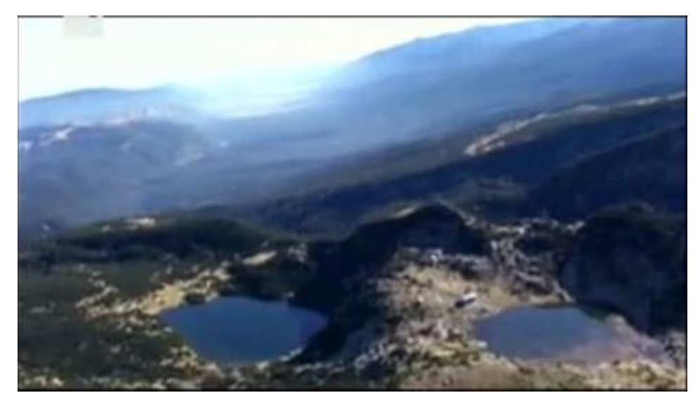
Fig. 1. Two of the Seven Rila Lakes. Film still from The Hamlet Adventure .