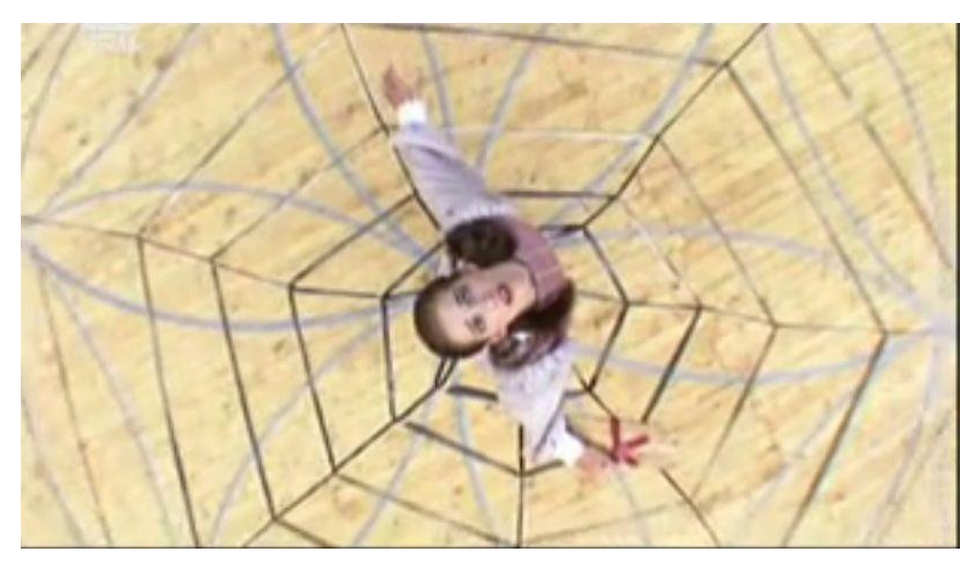
Fig. 4. Ophelia caught in the cobweb of betrayal. Film still from The Hamlet Adventure .

and tighter by obsequious courtiers. Spun like a top in the gathering fog, in the last frame of Gertrude's scene the Queen literally appears to have lost her head, her lifeless stare turned upwards as her costume becomes an extension of the court's cobweb. On her part, Ophelia offers some resistance, the shot/reverse shot sequences capturing her accusatory glances that bring to mind the suggestive critique of the court in the songs of Shakespeare's Ophelia. Yet, she, too, is overpowered—a demise rendered through the cinematic symbolism of the fatal cobweb. At this point, as the camera zooms out in a top shot, we see how the web of perfidy has re-drawn the Egyptian Flower of Life, with which the stage was patterned (fig. 4). Ophelia's submission to the power games of Elsinore has destroyed her, and with this, moral stupor has overpowered the spiritual order of her world.