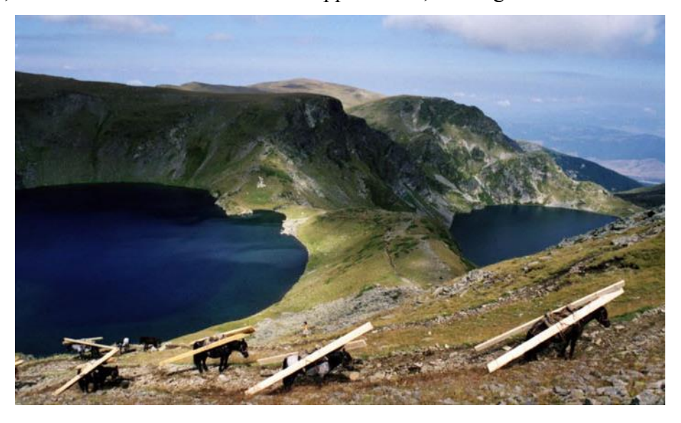
Fig. 2. Transportation of materials for the set.

Shooting a feature film in an alpine wilderness is by definition a risky endeavor. With no infrastructure, everything and everybody had to be transported on horseback up and down treacherous trails, including actors and crew, filming equipment, wood for the stage construction (fig. 2). This "daily adventure," as Pavlov describes the trail ride to and from the lakes, was strenuous and dangerous, but it formed the mindset of the crew and developed a trust as they clambered up the treacherous path tied together on a lead rope. "This was the bridge," Pavlov summarizes, "between the real world and the upper world, the stage."